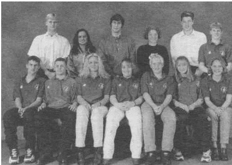
Senior Swim Team 1996