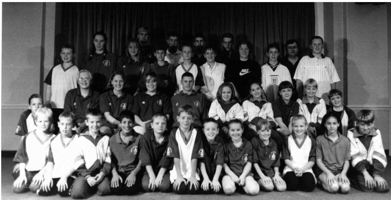
Junior Swim Team 1996