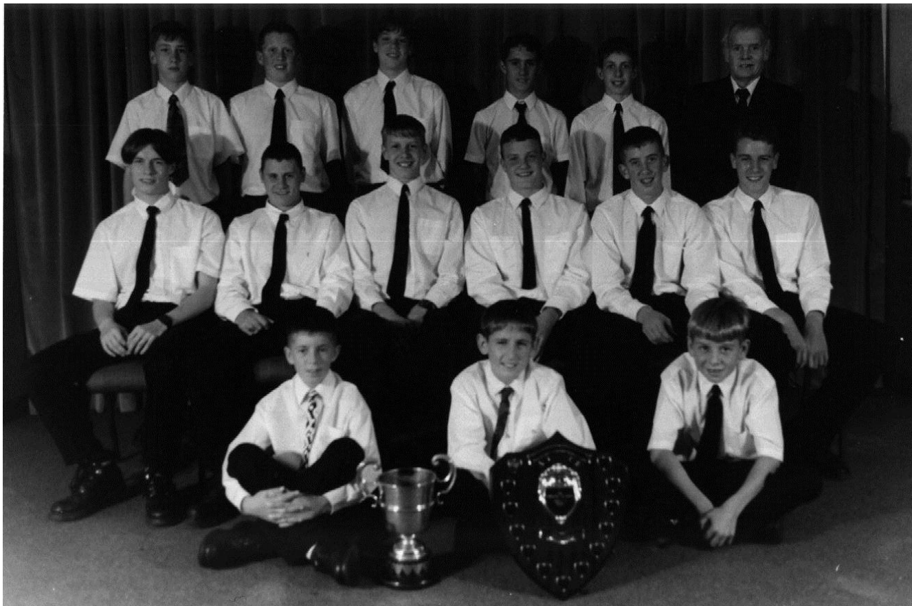
Junior Polo Team 1996

The U18s Water Polo team entered the Northern Counties U18s competition for the 1 st time and won it.